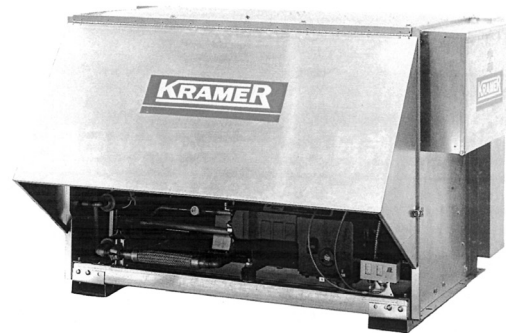
SIZE 0400 - 1200